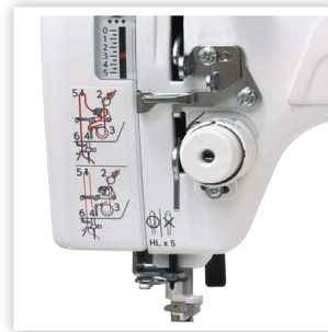
ADJUSTABLE THREAD GUIDE