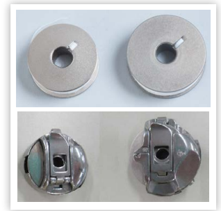
1.4X LARGER BOBBIN