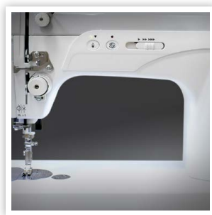
SIX LED LIGHTS